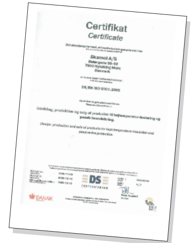
Skamol A/S - ISO 9001:2000 certificate