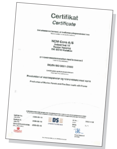
NCM Core A/S - DS/EN ISO 9001:2000 certificate